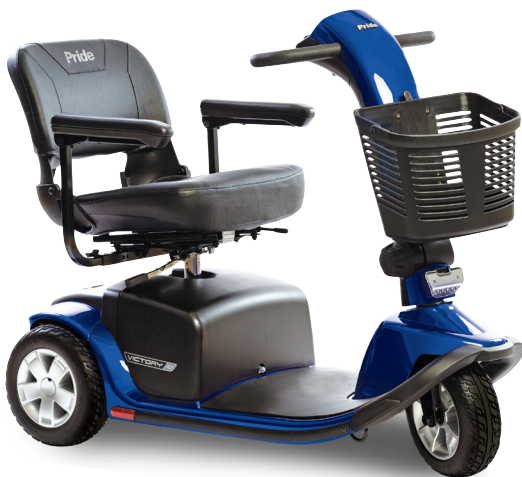
3-Wheel shown with optional 22" wide high-back seat

The Victory® 10 series offers added style, comfort and performance for your active lifestyle. Standard features include LED pathway light, LED battery meter, feather touch disassembly, wraparound delta tiller, 10" solid tires and a front basket. A 400 lb. weight capacity, a per charge range of up to 16 miles and a maximum speed up to 5.3 mph compliment the versatility of the Victory 10. Available in Viper Blue and Candy Apple Red.